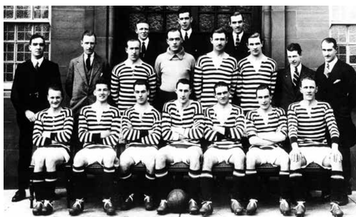
QP 1st XI - 1922 - 23